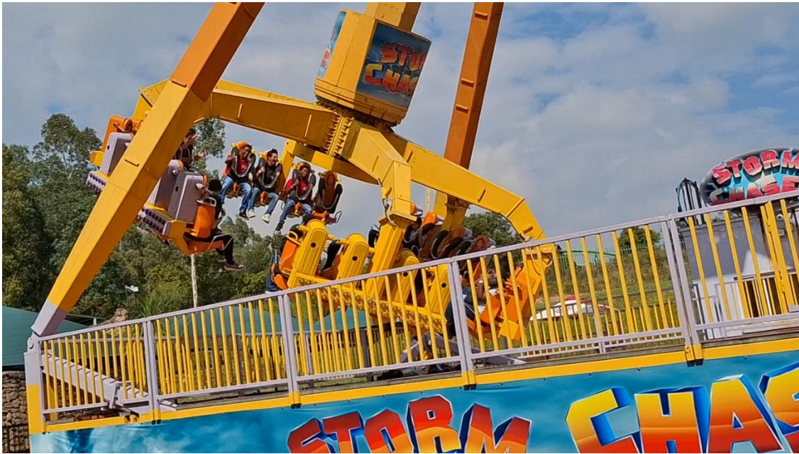
CHASING THE STORM: Vuyo, Diago, and Lesego acting all nonchalant early in the day while riding the 'Storm Chaser'.